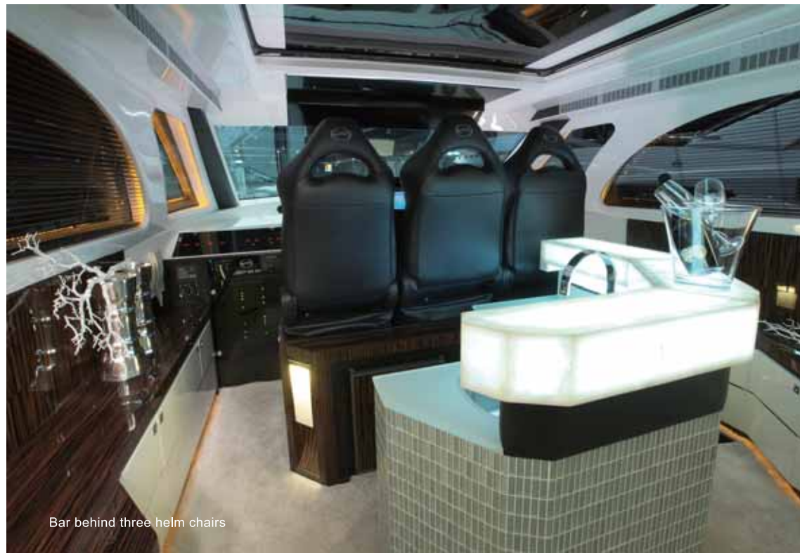
Bar behind three helm chairs