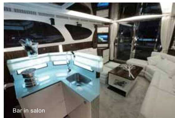
Bar in salon