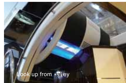
Look up from galley