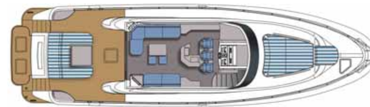
Main Deck B