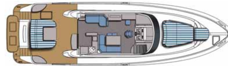
Main Deck A