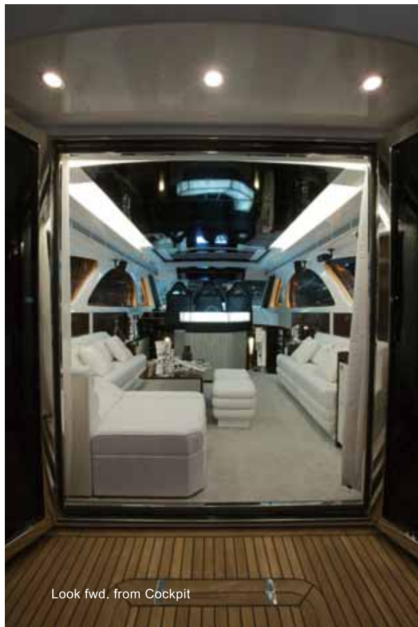
Look fwd. from Cockpit