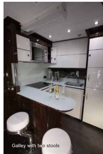
Galley with two stools